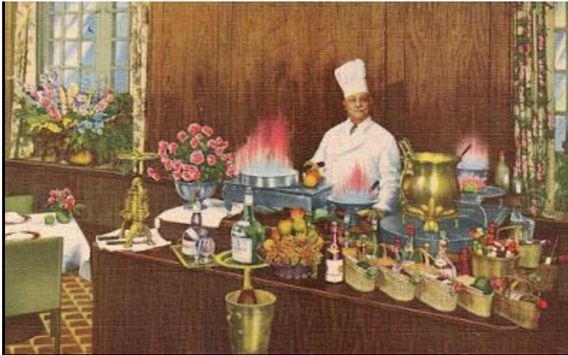
Henri Charpentier at Café de Paris in Chicago, early 1940's

We hope you bought your ticket early. Word has it that tickets are going fast. When Esther Jollan called that she was sold out after only having tickets for four days, we almost fainted but we’re very happy because it means you like what we are doing. That is the best!!