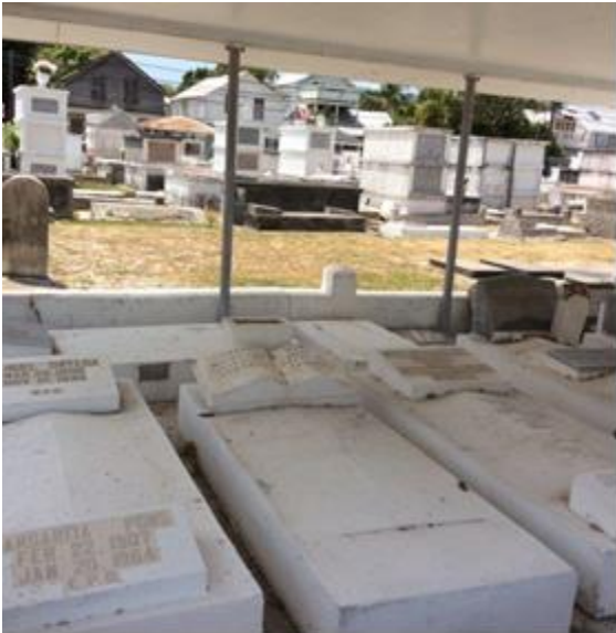
This departed soul was enjoying a book