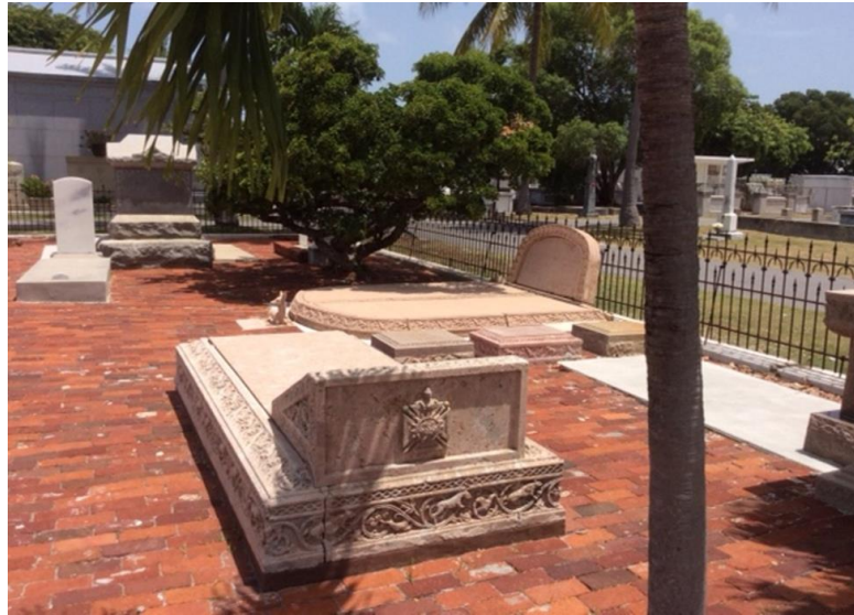
This grave stone at 3 o'clock is a double bed with three pet graves stones to the left. There is a faun deer at the foot of the bed, a favorite of Key West.